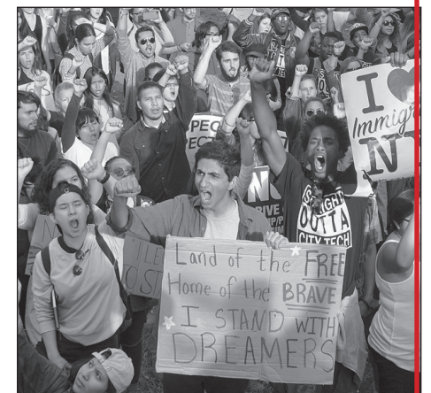
At Trump Tower in New York, civilians march in support of Dreamers and DACA.